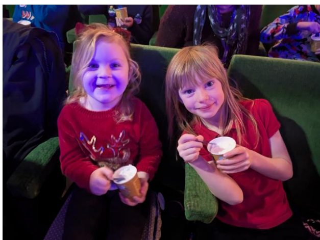
The children enjoyed their ice cream at the interval.