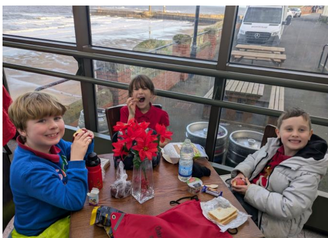
They got to watch the sea whilst having lunch before returning back to school.