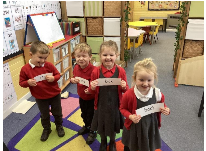
We have been working so hard in our Little Wandle phonics lessons.