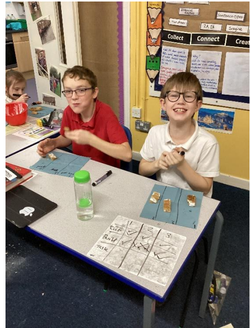
Evaluating the taste and texture of 3 different gingerbread recipes was probably the highlight of this week!