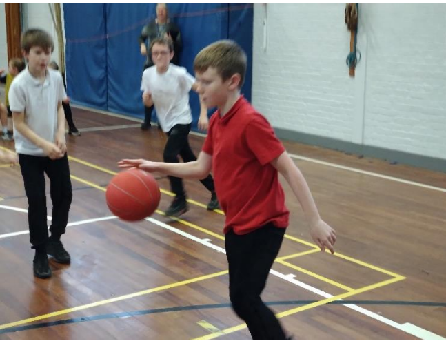
Basketball at Whitby Sixth Form was great fun.