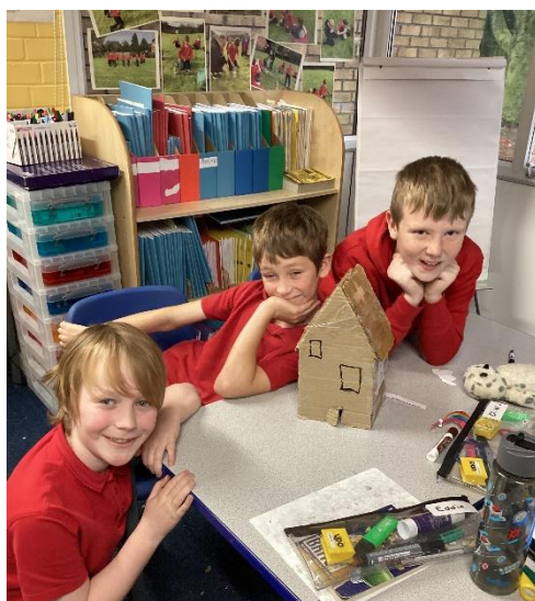
We designed our own edible Christmas houses in DT.